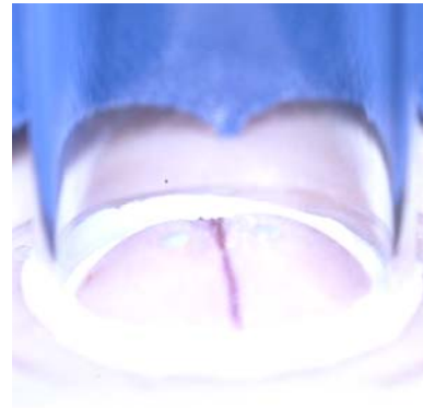
3-D Test Model